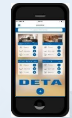
Smartphone or Tablet