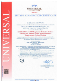
EU Type Examination Certificate